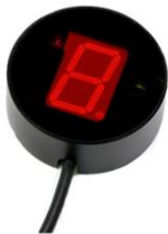
Small Housing Style