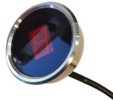
Gauge Pod Style

Designed for a standard 52mm / 2 1 / 16 in gauge pod.